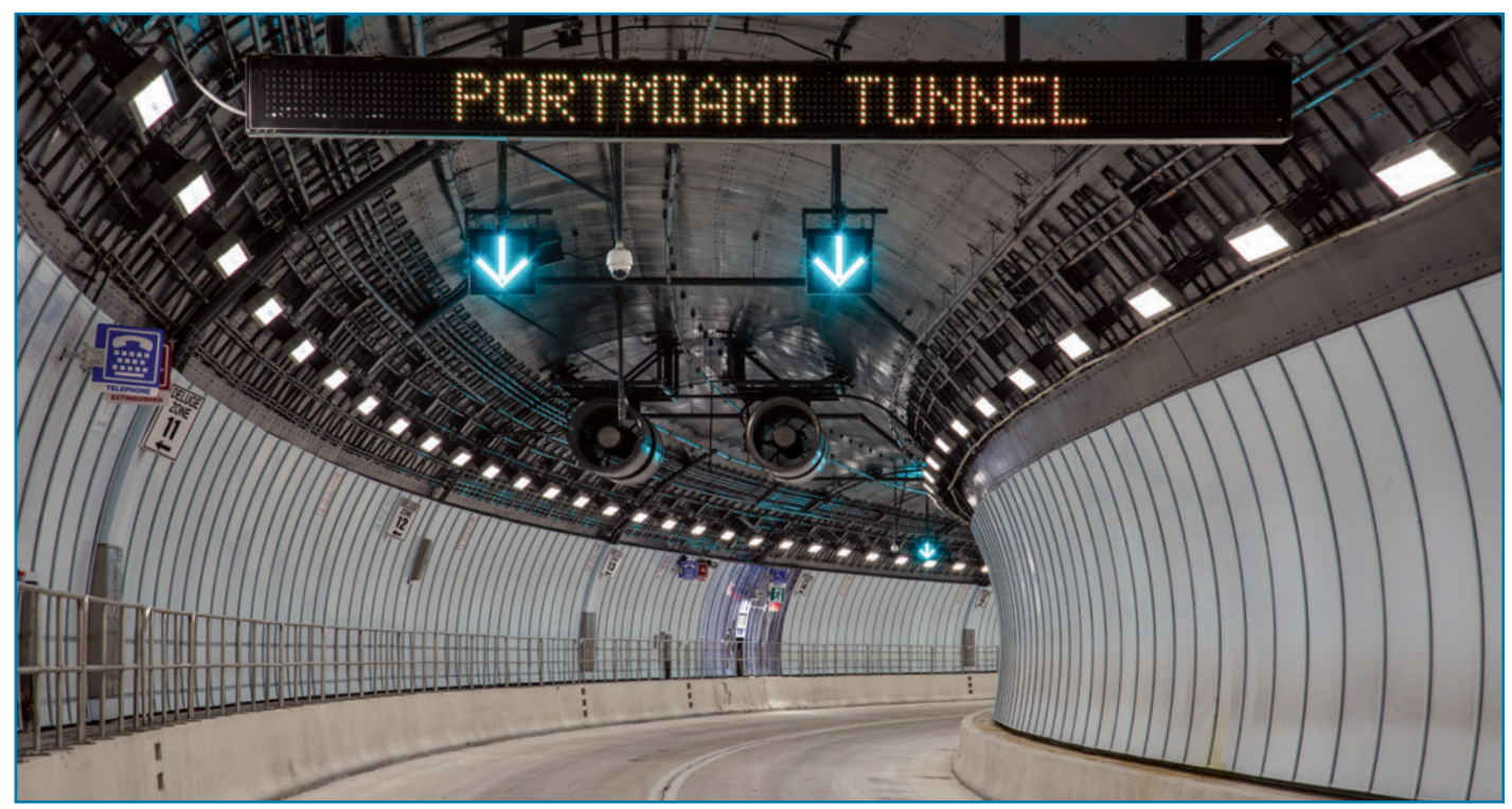
Duranar XL and Duracron coatings by PPG were specified for use in the PortMiami Tunnel, South Florida's newest landmark, because they combine bright color with exceptional resistance to abrasion, salt, humidity, car exhaust and fading.

PPG IdeaScapes Products: Duranar ® XL coatings and Duracron ® coatings Metal Fabricator: Metalwërks, Kennett Square, Pennsylvania