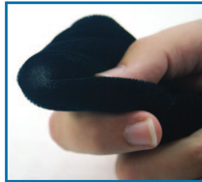
Chalk rating: 5