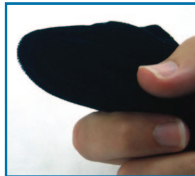
Best chalk rating: 10